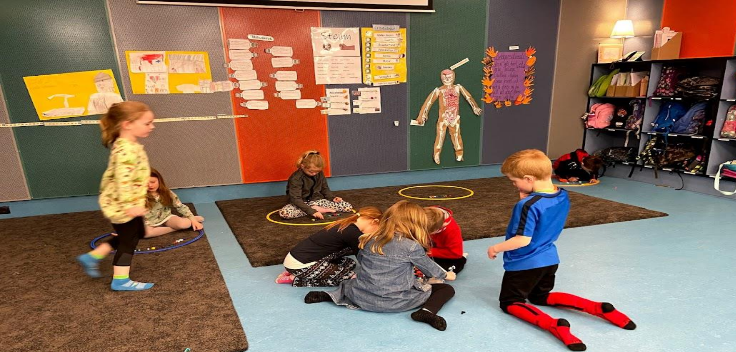
The Icelandic school system